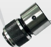
AIR HAMMER COUPLING (Automatic)