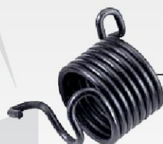
AIR HAMMER RETAINER (Open type)